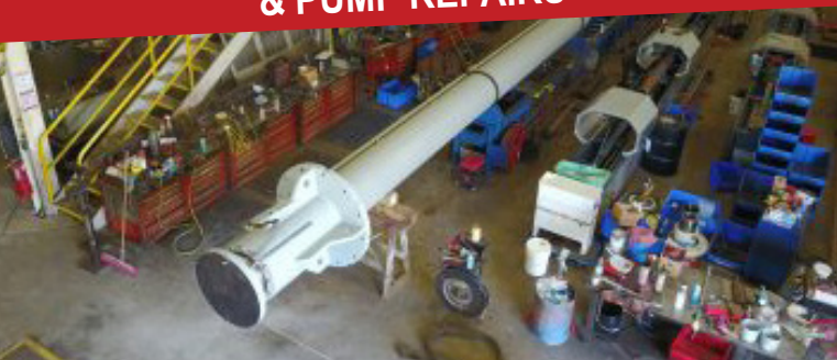
HYDRAULIC CYLINDER & PUMP REPAIRS