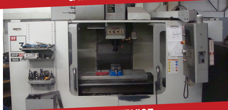
CUSTOM FABRICATION & MACHINE SHOP