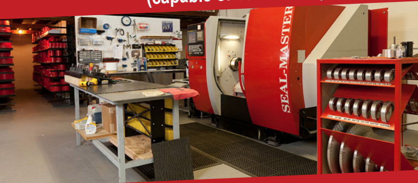
SEAL MACHINE (capable of 600mm OD)